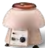
◀ DSC-200A-1 ◀ DSC-200T